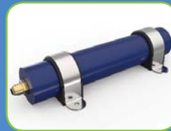
Optional Load Cushion for improved handling.