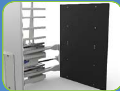
Rubber faced contact pads for optimal friction.