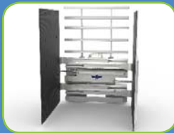
Thin arm profile provides easy breakout.