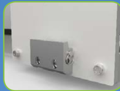
Optional quick disconnect mounting for fast install.