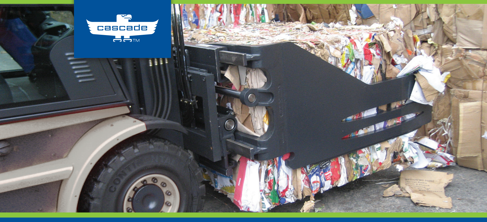
Rugged and durable material handling solutions.