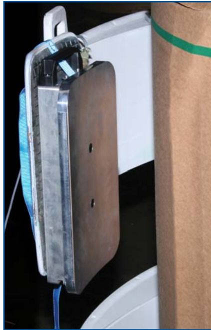
Placing the Clamp Force Tester between the paper roll and the contact pad.