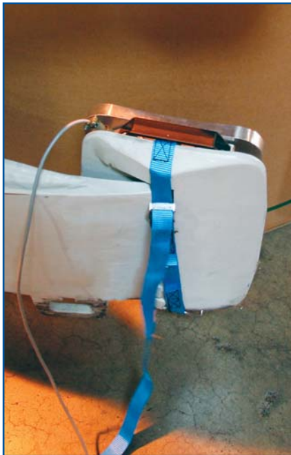
Connecting the Digital Clamp Force Display to the Clamp Force Tester.