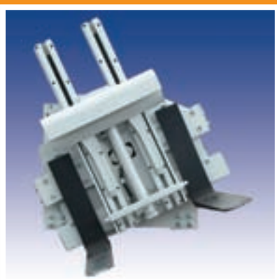
Hydraulic Top Arm

Cascade Europe • Damsluisweg 56 • PO Box 3009 • 1300 EL, Almere, Netherlands • Tel +31 (0)36 54 92 911 Cascade (UK) Ltd. • Unit 4, 12 O'Clock Court • Attercliffe Road • Sheffield S4 7WW, England • Tel +44 (0) 870 850 8756