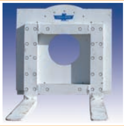
Fixed Fork Combined