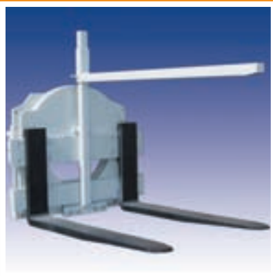
Mechanical Top Arm