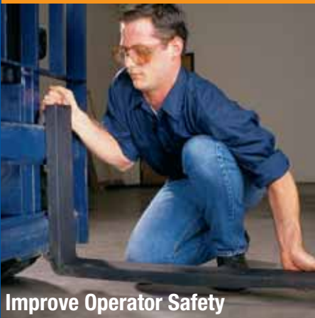
Improve Operator Safety