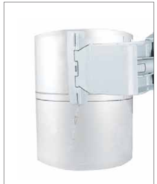
Photo (above) shows damage caused when arm drops due to slack in the chains. This situation can be eliminated with Cascade's Drop Stop Valve. The savings in one day can pay for the added cost.

Damage is caused by the tendency for a lift truck driver to hold the lowering control valve open after the load has been safely deposited. This over-riding causes slack in the lift chain and subsequent dropping of the carriage which causes damage to the load from the forks or attachment arms.